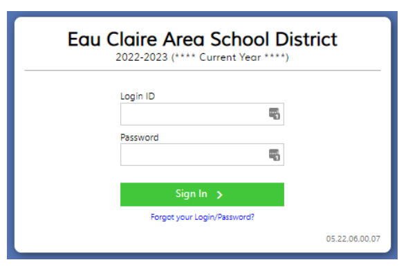
Skyward to Canvas Login Screen