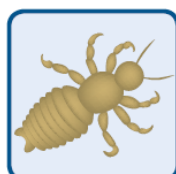
Full Grown Louse