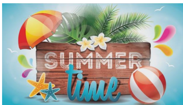
From Special Education Family Engagement Newsletter: Summer 2021

Summer distribution is on Thursdays from 8 a.m. – 4 p.m. in the main office at North (June 17, June 24, July 1, July 8, July 15, July 22, August 5).