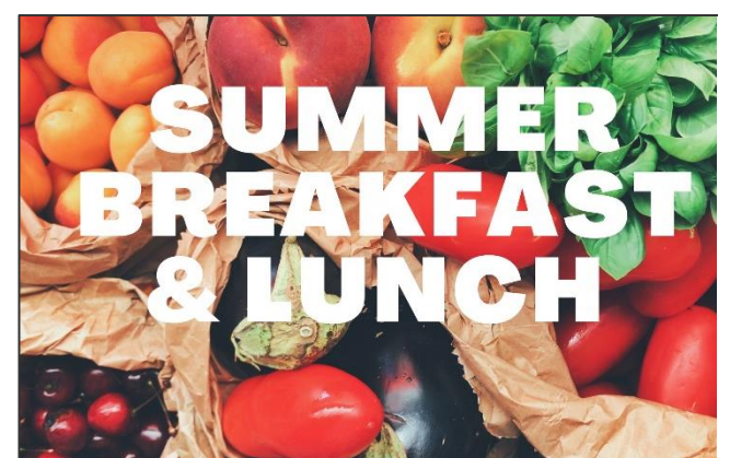
See page 25 of the 2021 ECASD Summer Program Guide for specific times at North.

As a service to the community, the Eau Claire Area School District provides electronic flyers for outside community activities that may be of interest to students/parents in the ECASD.