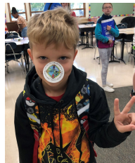
Welcome Back Day!

Flynn is an active place. We try to capture those moments and share them with you!