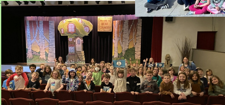
Kindergarten and 2nd grade enjoyed The Berenstain Bears at the Children's Theater.

1st grade had a great time exploring the Public Library. Click on the photo for more pictures.