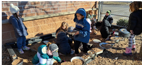
Kindergarten opened an outdoor bakery.