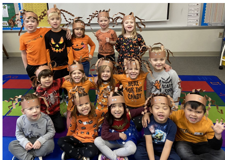
Kindergarten made spider hats!