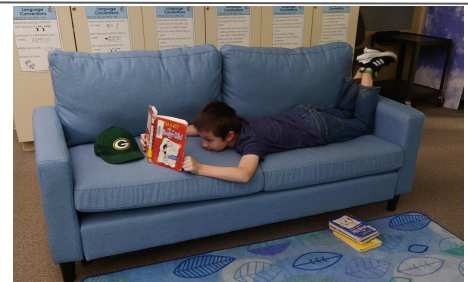
Ms. Drazkowski's 4th grade class earned their peace goal of checking out with a level 1 whisper voice three times! They celebrated with an extra book at checkout time.