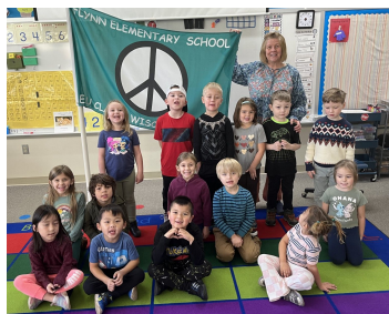
Students in Mrs. S's class earned their peace goal of 10 calm and quiet transitions.