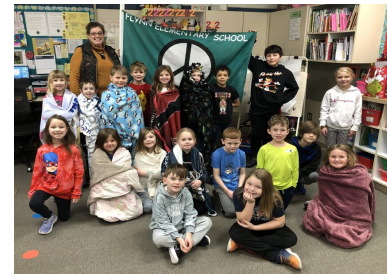
Ms. McRaven's 2nd grade class met their peace goal of lining up quietly 20 times. They celebrated with a blanket fort day.