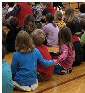
Click on the photo for more pictures of the All-School Meeting.