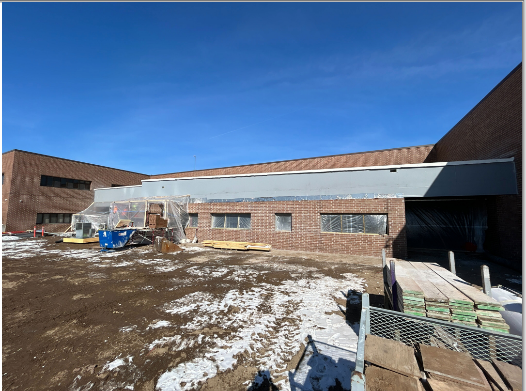
Area D Addition