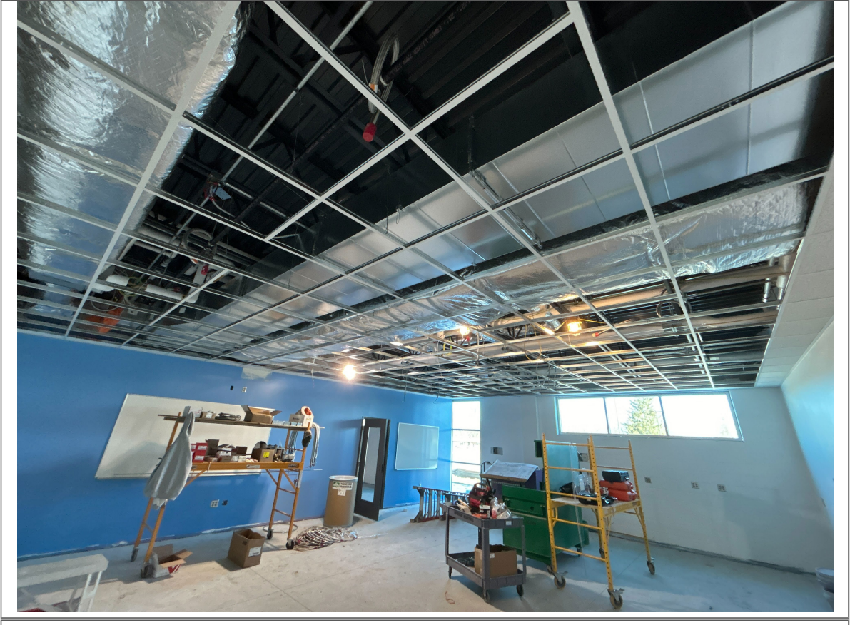
Ceiling Grid Installed