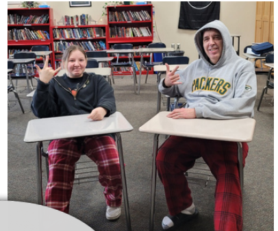
Students dress like staff/staff dress like students