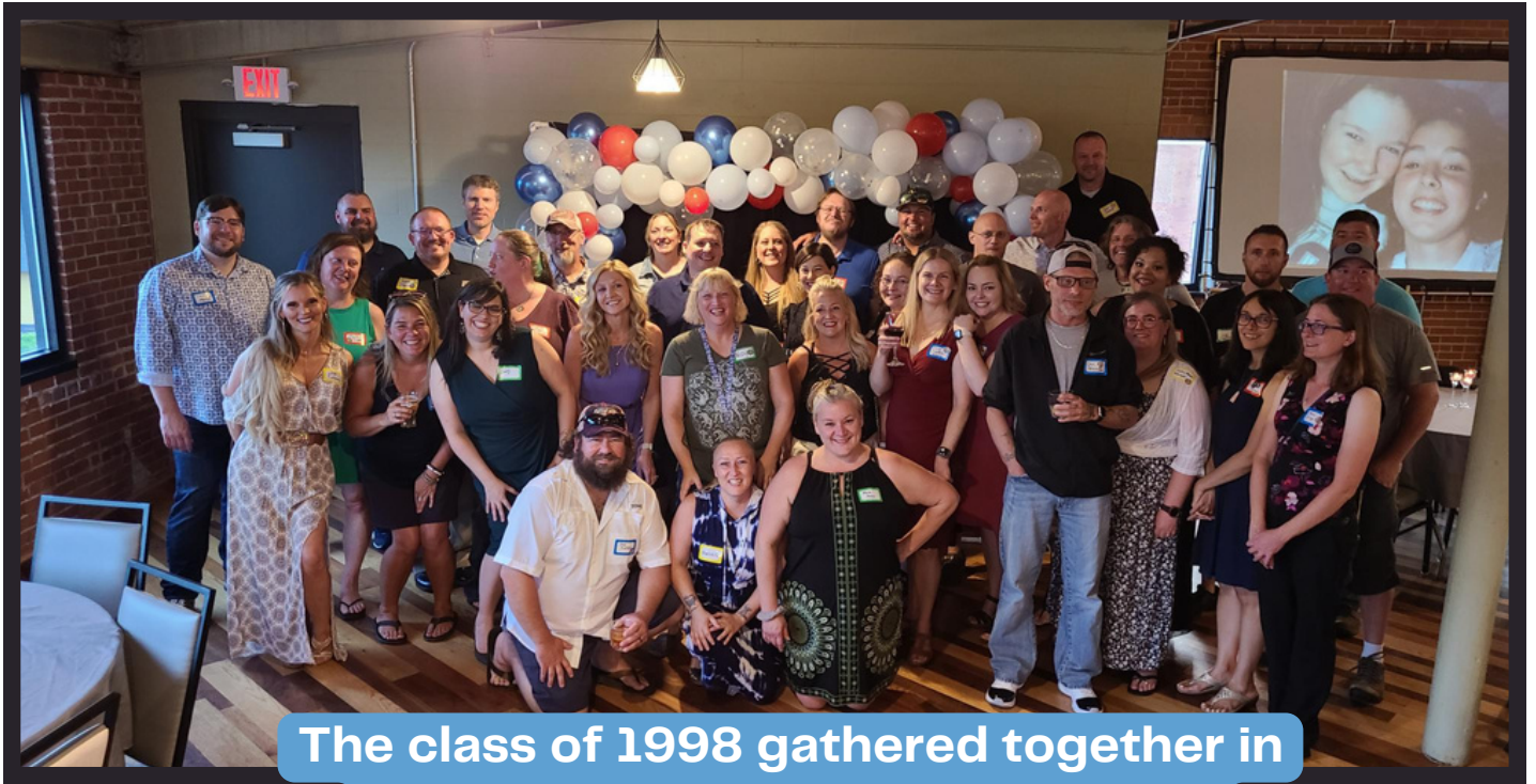
The class of 1998 gathered together in August for their 25 year reunion!