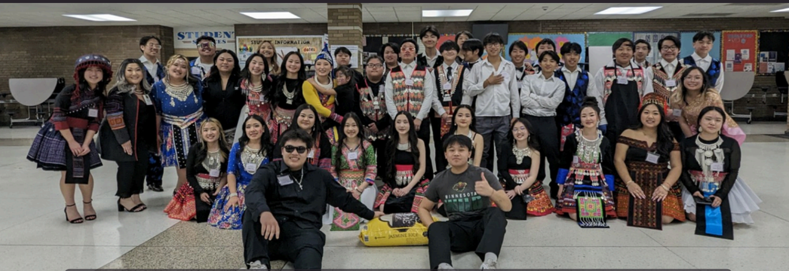
Hmong Club hosted their 3rd Hmong Heritage Event last Friday and they did awesome! There were about 330 people in attendance and the members were really proud to host the community on Friday night. We appreciate you all for your support.