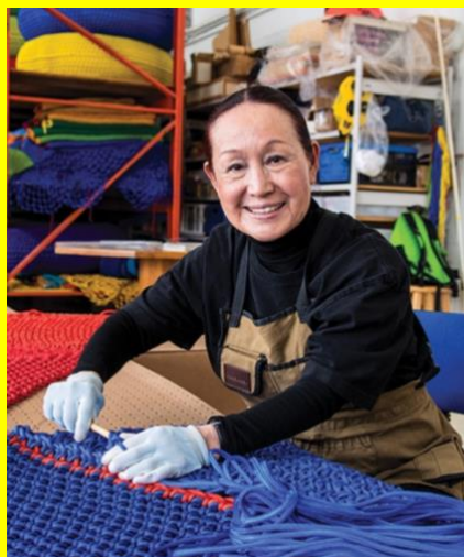
A Japanese fiber artist born in 1940, she is best known for her colorful crocheted playgrounds