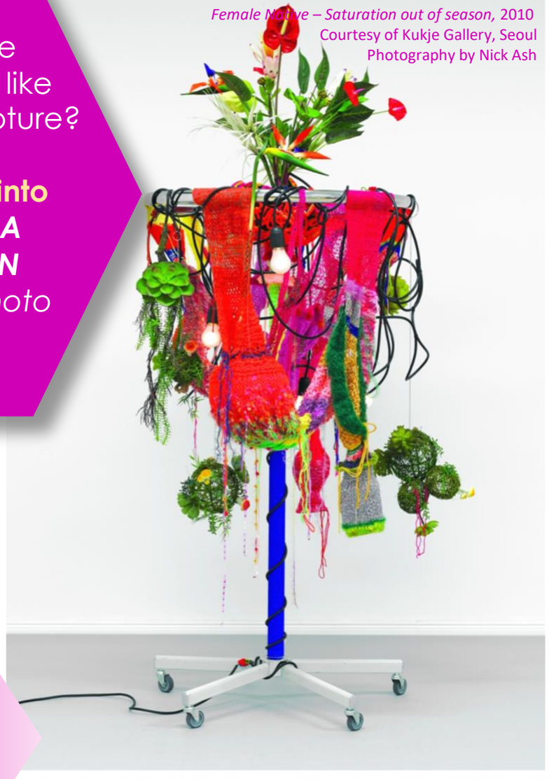
Female Native – Saturation out of season, 2010

Knitting is a folk art that uses two “needles” to create interlocking loops of yarn that form patterns.