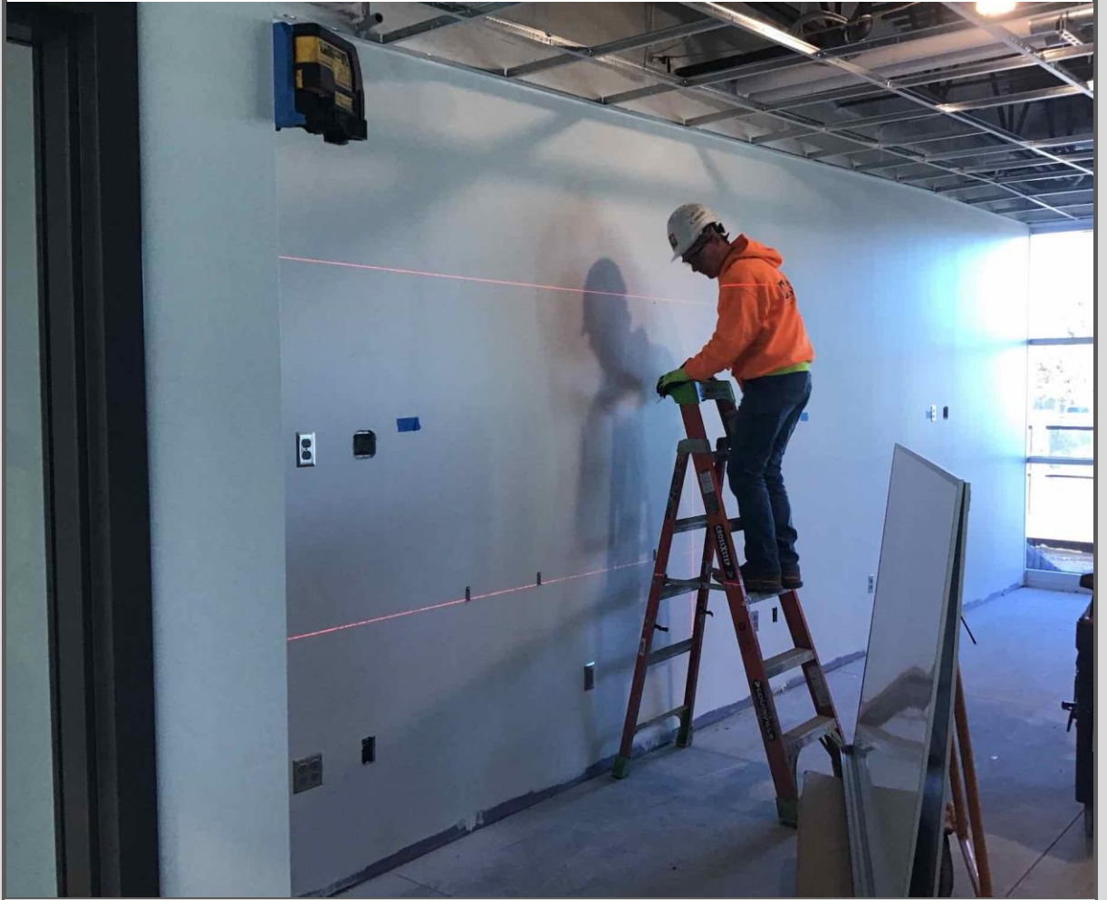
Installing Marker Boards