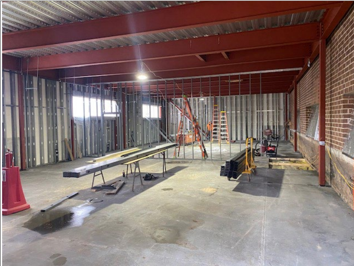
Floors poured area B, started framing walls