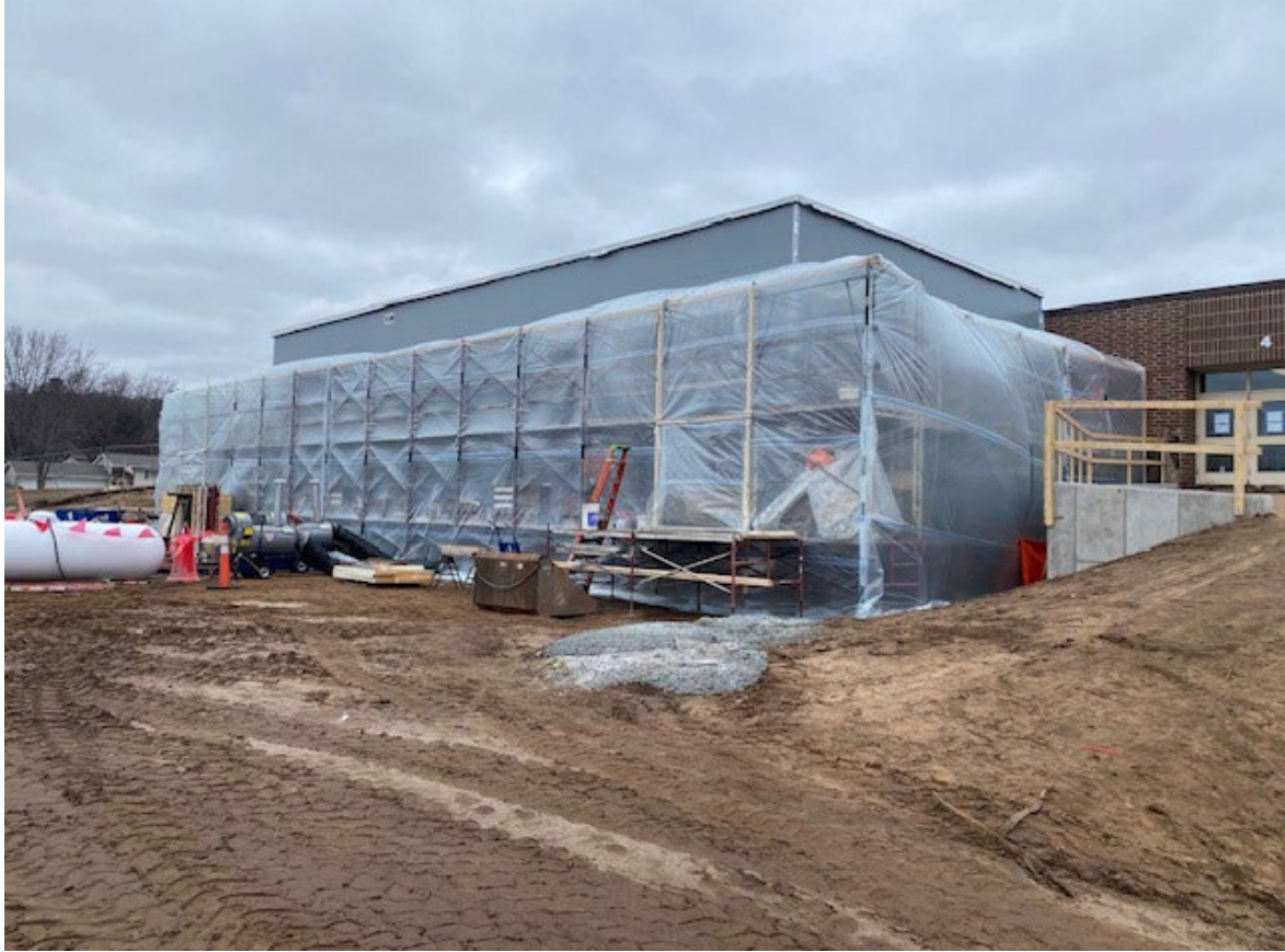
Scaffold for brick area A