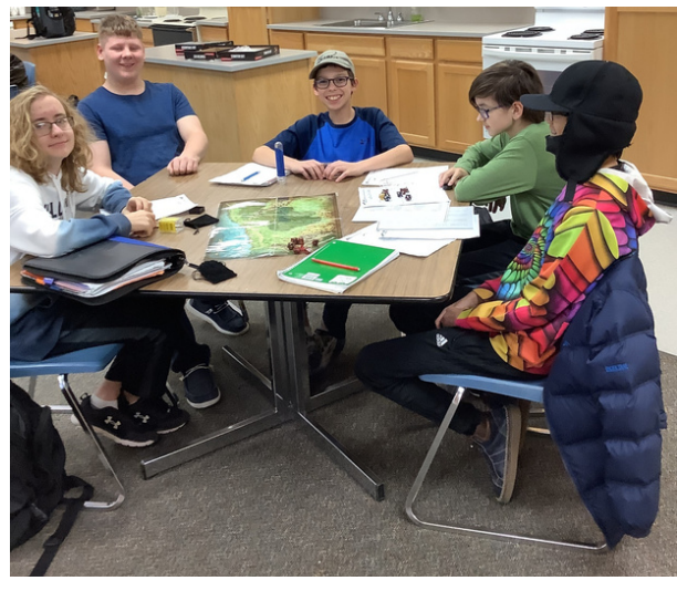
Dungeons and Dragons & Fiber Arts

Students in our afterschool clubs are busy learning and laughing with their friends. These are just a couple of the clubs offered this semester.